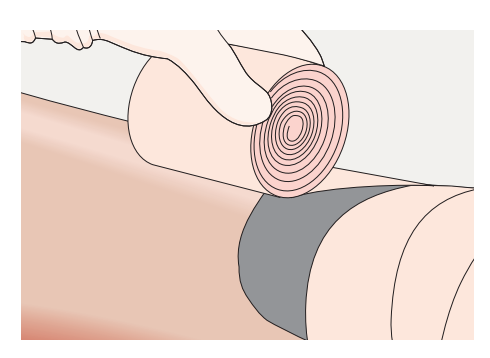
3. When necessary, fixate Mepilex Ag with a bandage or other fixation.