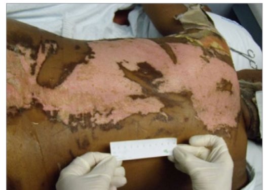
Figure 4 | End of treatment (Day 8)

Acknowledgement: This case study report has been prepared by Mölnlycke, based on information and photographs taken from a Mölnlycke-sponsored clinical investigation (ClinicalTrials.gov identifier: NCT00742183)