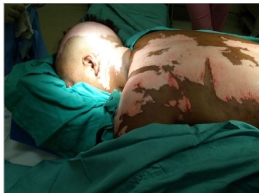
Figure 3 | Baseline visit after surgery