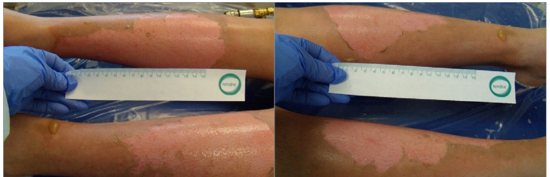
Figure 5 | Baseline visit

A 12-year-old male was admitted to hospital with a second-degree flash burn injury (11.75% TBSA) within 15 hours after the injury (Figure 5). Mepilex® Ag was applied as part of the burn treatment regimen. Complete healing was recorded on Day 7 (final visit; Figure 6).