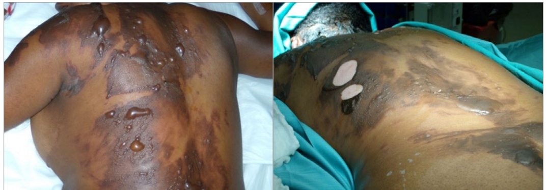
Figure 2 | Baseline visit before surgery

A 38-year-old female was admitted to hospital with a second-degree scald burn injury (10% total body surface area [TBSA]) within 17 hours after the injury ( Figure 2 ). Surgical debridement was performed at the hospital ( Figure 3 ) and Mepilex® Ag was applied as part of the burn treatment regimen. Complete healing was recorded on Day 8 (visit 2; Figure 4 ).