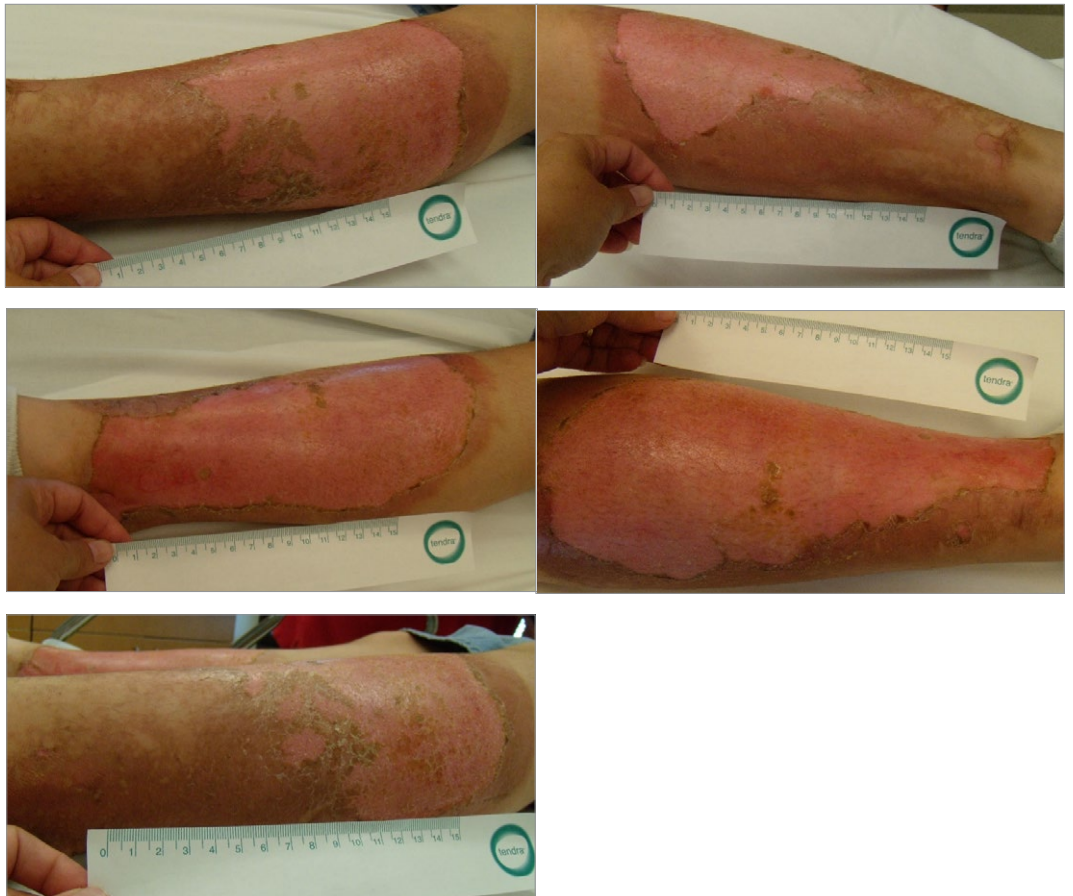
Figure 6 | Complete healing (final visit at Day 7)

Acknowledgement: This case study report has been prepared by Mölnlycke, based on information and photographs taken from a Mölnlycke-sponsored clinical investigation (ClinicalTrials.gov identifier: NCT00742183)